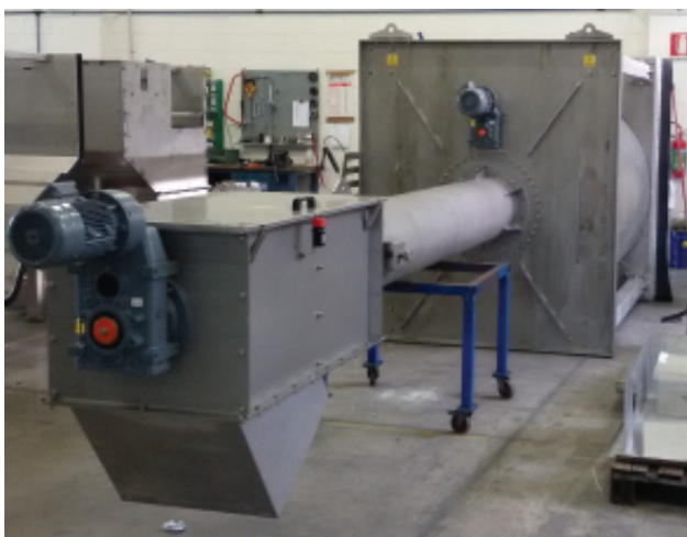
Rotary drum screen