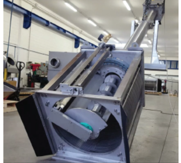
Rotary drum screen with bars